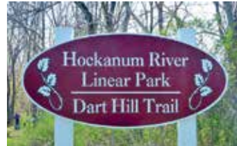
The Dart Hill Trails are Vernon's section of the Hockanum River Linear Park.